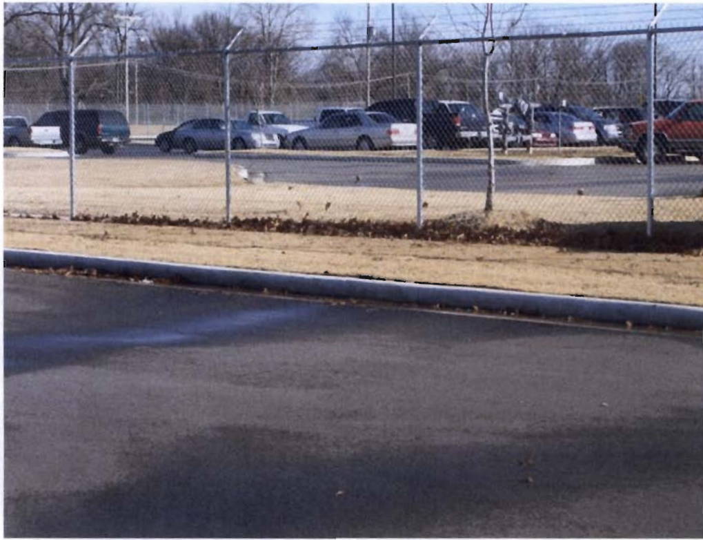
Northeast side of Warehouse expansion