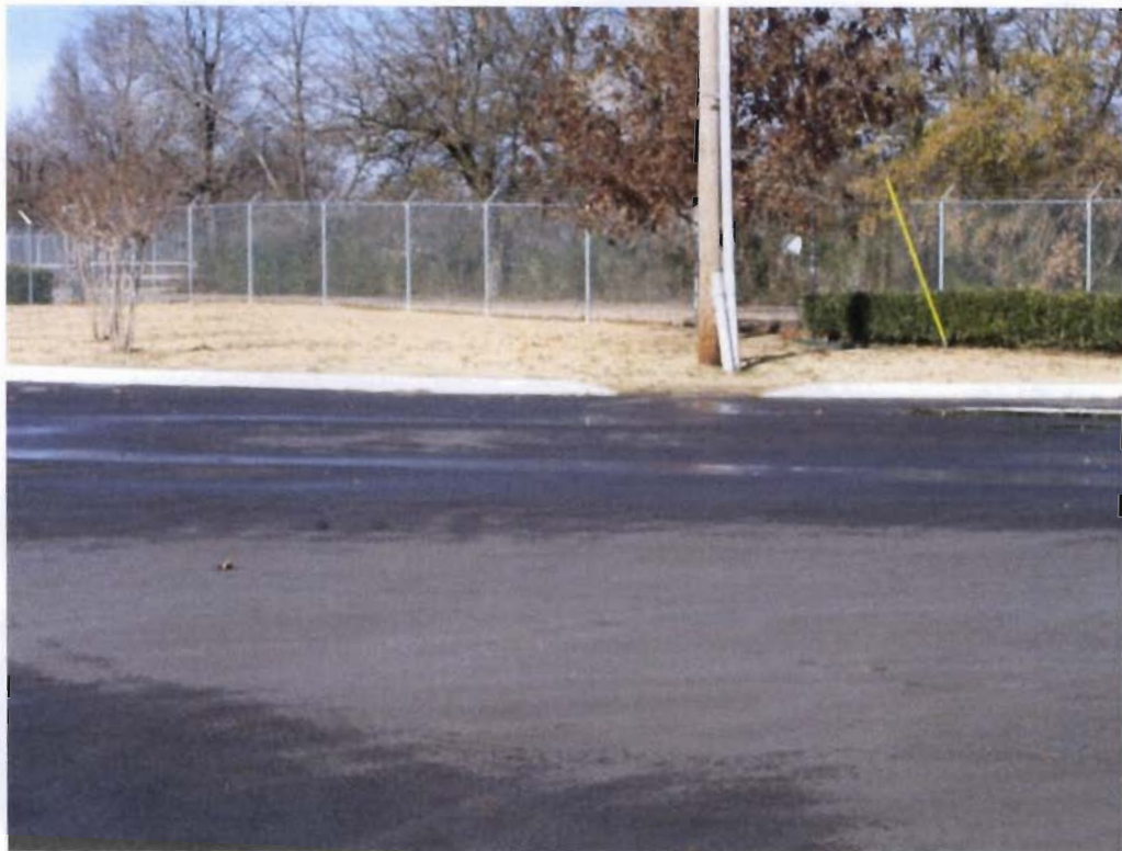
North END OF WAREHOUSE Expansion