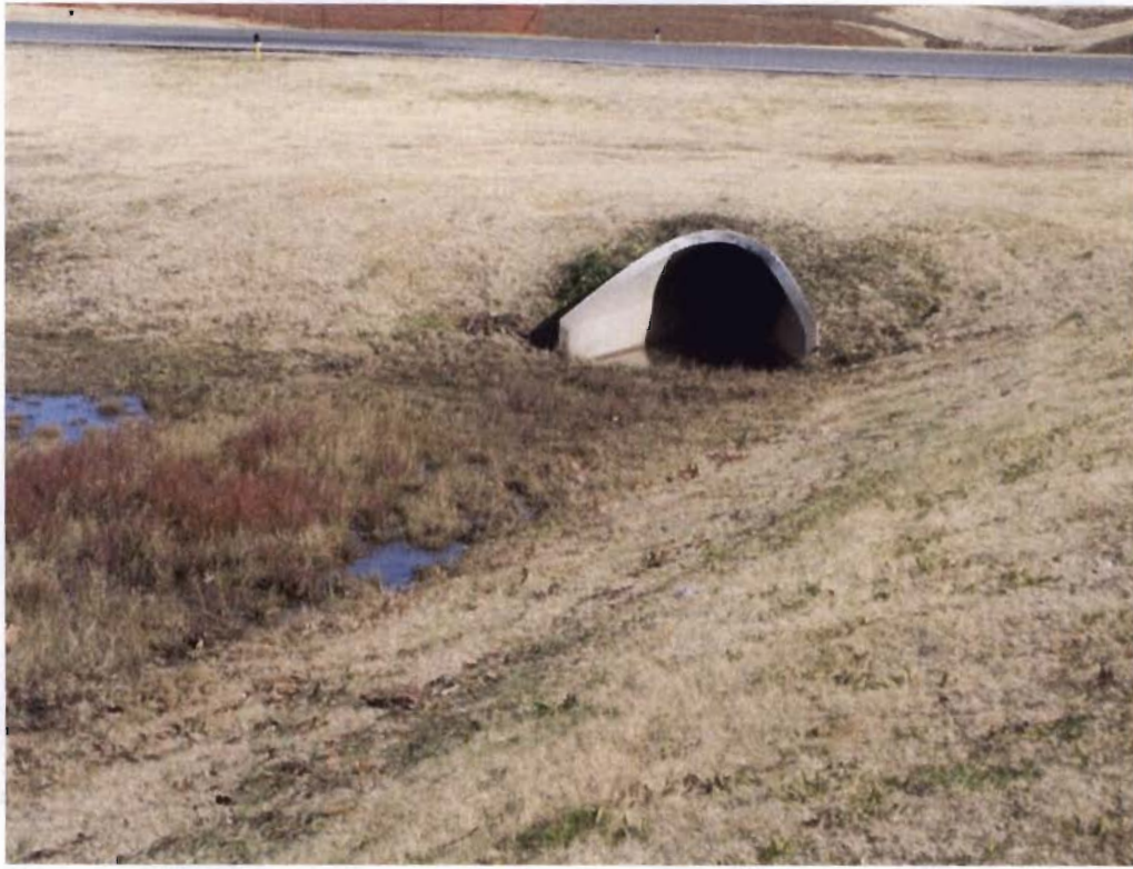
EAST SIDE OF PAINT HANGAR 3