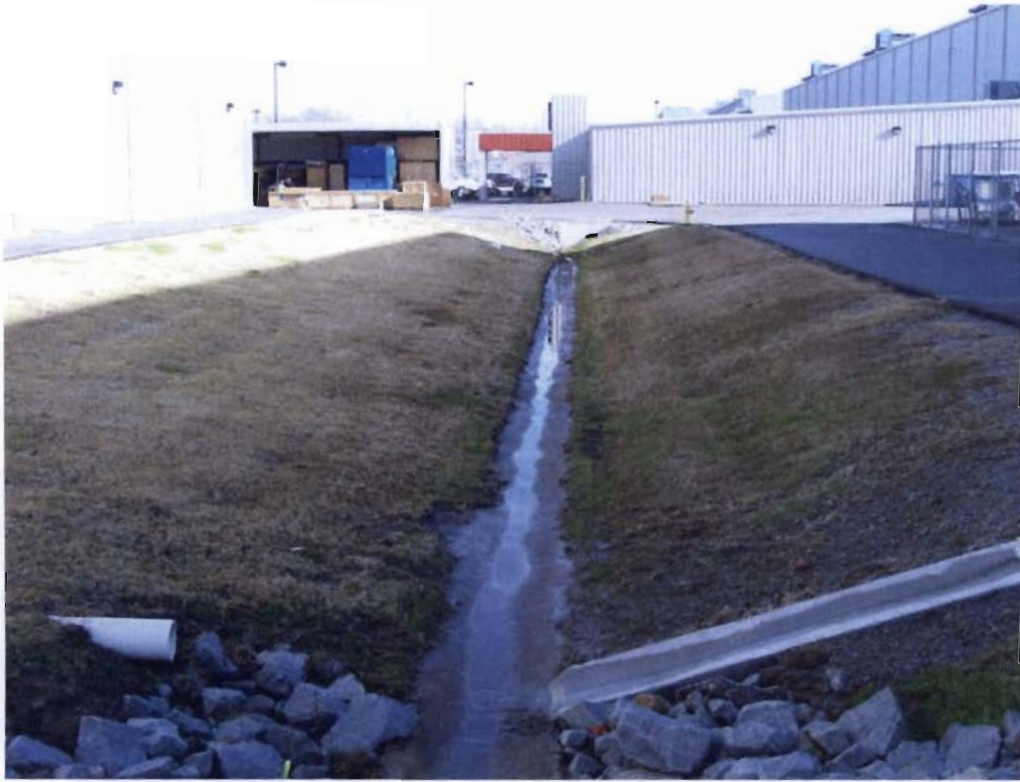
Southeast side of Warehouse Expansion.