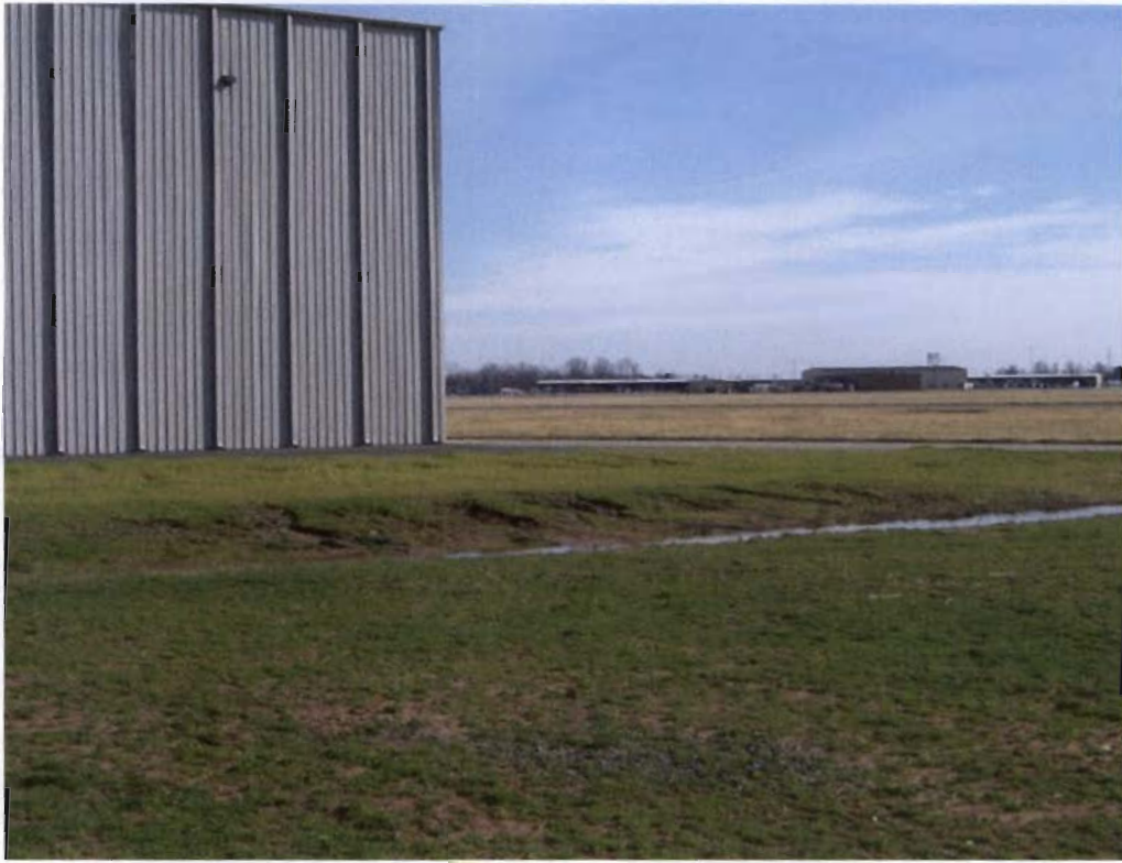
WEST SIDE OF PAINT HANGAR 3