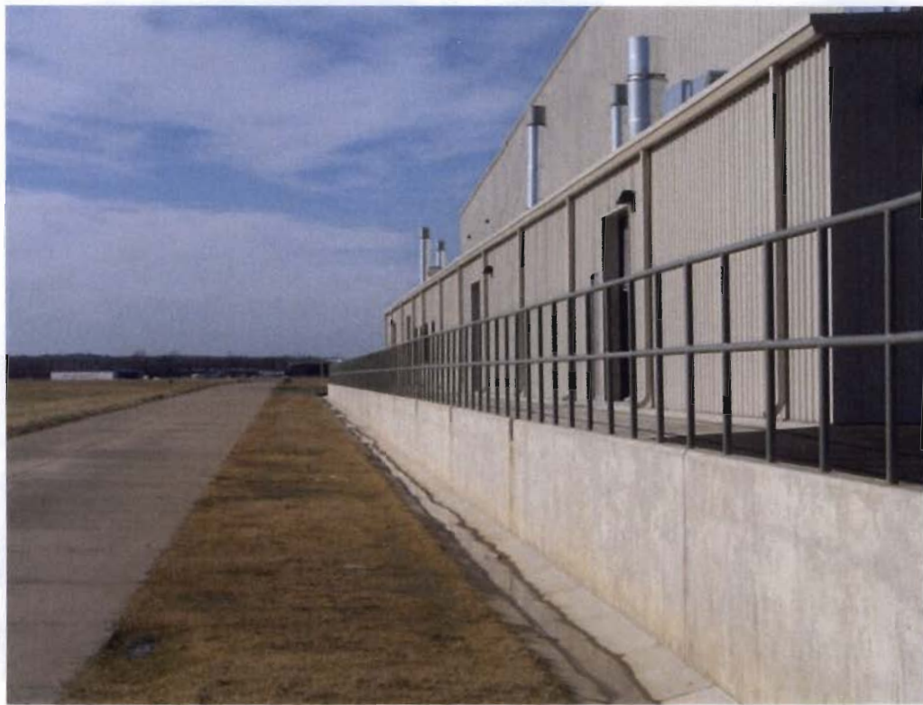
Southeast Side of Paint Hangar 3